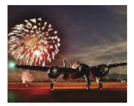
Bronze Award (tie) Wings Over Houston Airshow Houston, Texas