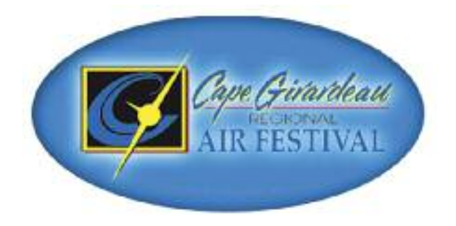
Bronze Award Cape Girardeau Regional Air Festival Cape Girardeau, Missouri

The Cape Girardeau Regional Air Festival developed an innovative plan to overcome the parking challenges it had during its previous show. In a wonderful example of local community involvement, show officials reached out to neighboring businesses to secure vital parking space. In return, those businesses received valuable sponsorship benefits and exposure among the thousands who attended the event. The plan eliminated the parking problems the show had had in the past, which improved the air show experience of spectators and addressed the concerns of local government officials and community leaders.