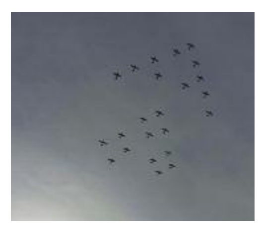
The Culpeper Regional Airport Annual Air Fest combined its traditional one-day air show with a unique program to launch a flight of 23 T-6 Texan aircraft for a flight to Washington, DC to honor military veterans. The historic tribute flight