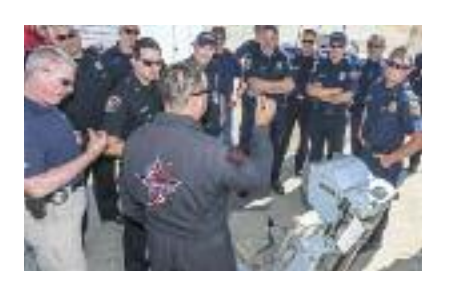
Bronze Award (tie) California Capital Airshow Sacramento, California

The California Capital Airshow has established a public safety program for this Sacramento-based show that uses a "unified command" approach that combines the talents and resources of 14 different Sacramento-area agencies to address the public safety requirements of the show. The event organizers use the show as a real-world training exercise that provides the groups and agencies involved with an opportunity to work together and establish relationships while also providing invaluable public safety programming for the tens of thousands of people who attend the California Capital Airshow.